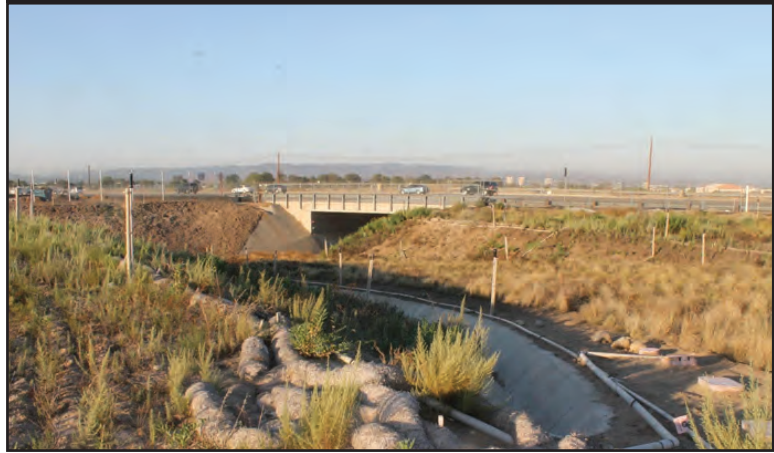
Heritage Fields