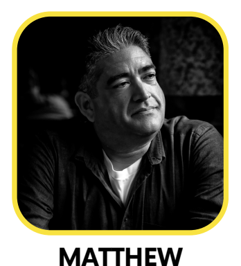
Teutimez Gabrieleño Band of Mission Indians - Kizh Nation and Laboratory of Indigenous Knowledge Systems